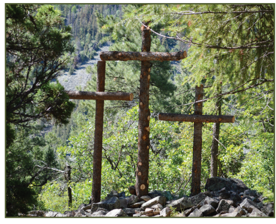
Newly Finished Prayer Walk

"We are doing better than ever, we are deeper, stronger, and more truly